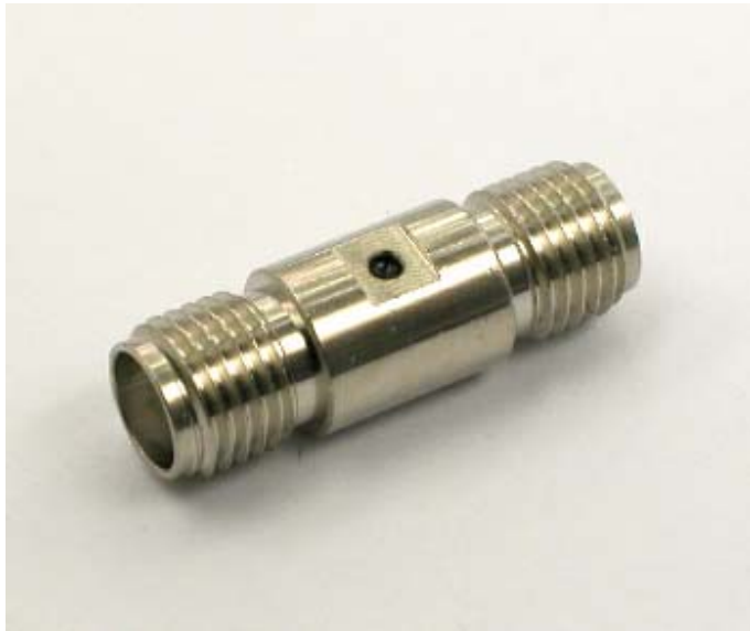
SMA(F) to SMA(F)