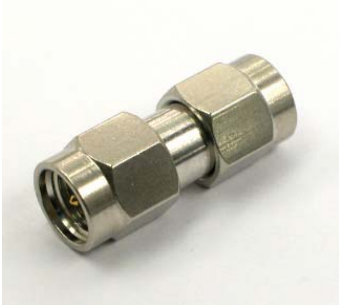
SMA(M) to SMA(M)